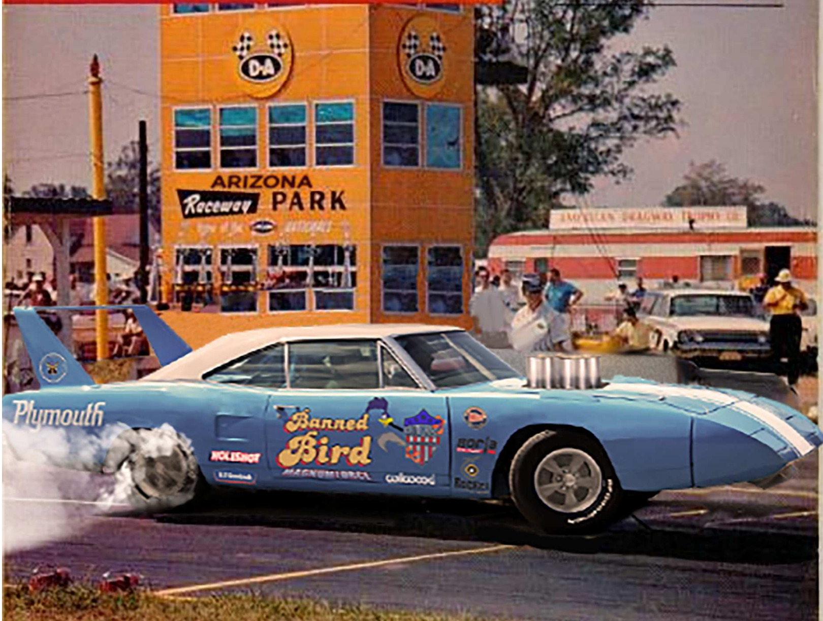
"BANNED BIRD" NHRA TOP STOCK ELIMINATOR